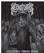
COLLECTIBLE HUMAN BODIES